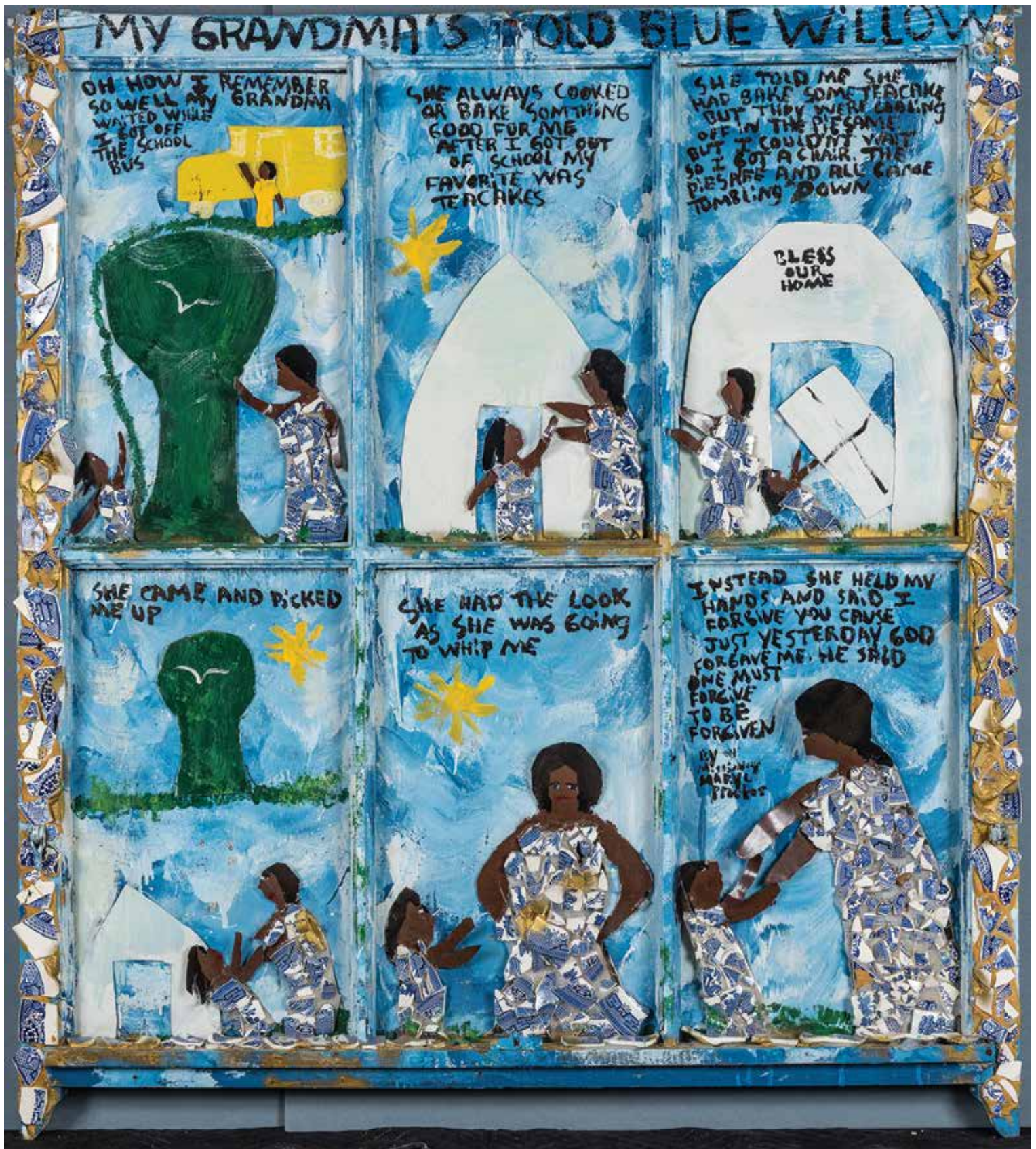
MY GRANDMA'S OLD BLUE WILLOW PLATES